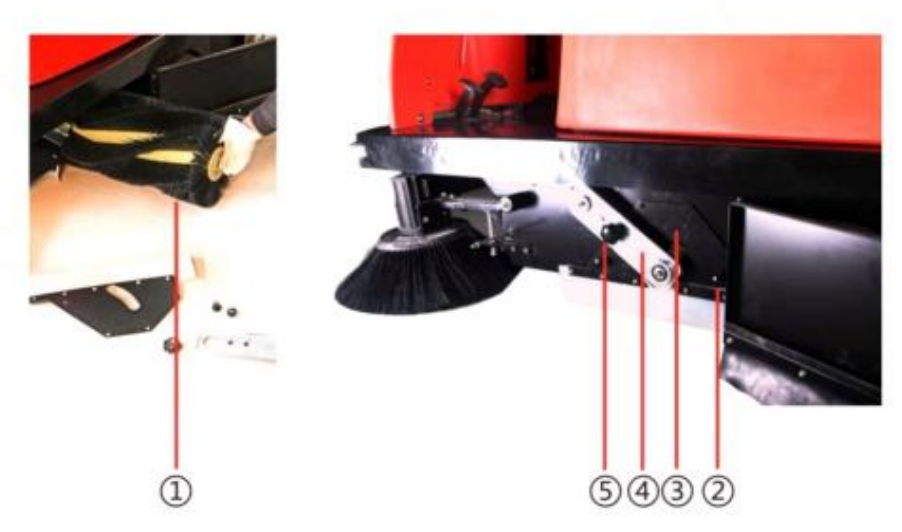
1 Rolling brush